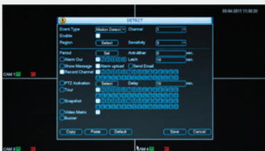
Motion Detect Settings